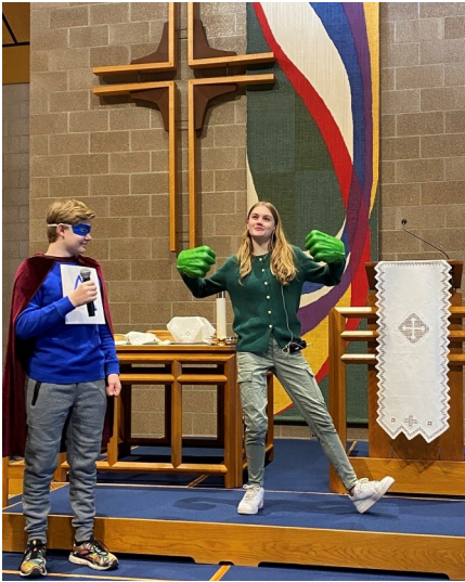
The youth reminded us of Bible stories about feeding the hungry and encouraged us to be heroes of generosity through the March Food Drive. As of March 27, Bethel has raised $12,390.