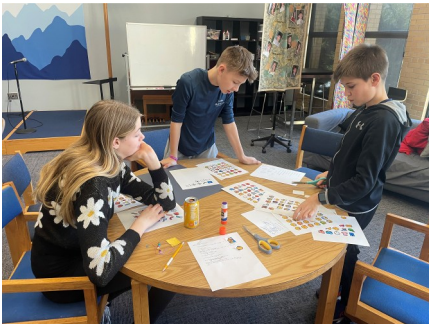
7th graders translated the Lord's Prayer into emojis at a special retreat.