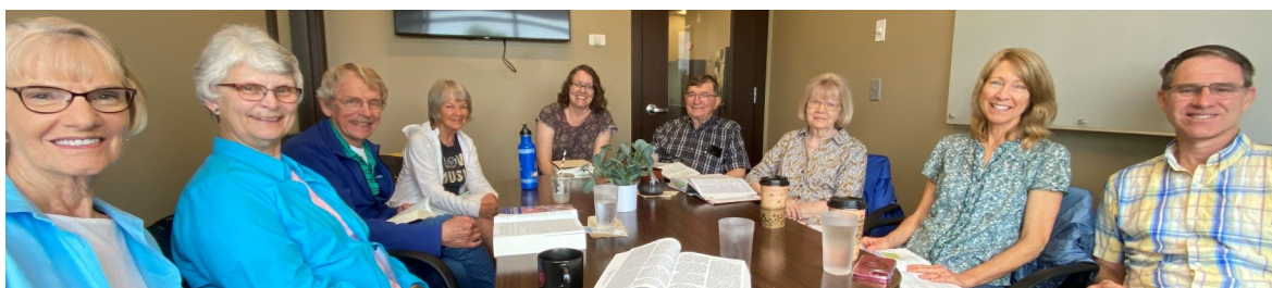
The Monday Bible study has participants who come every week and others who drop in when their schedules permit. Every time there is laughter and learning.